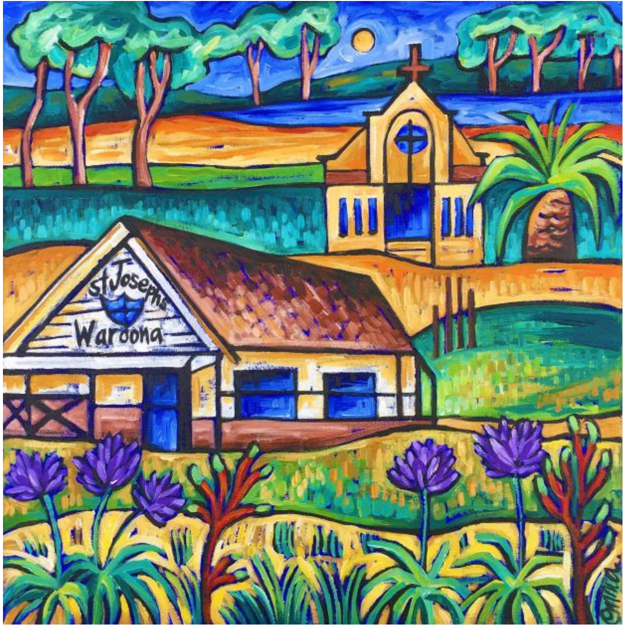
St Joseph's School, Waroona Newsletter