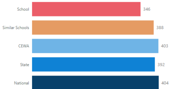
Mean Score Comparison for 2024